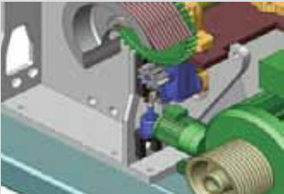
Slow rotation by gearmotor