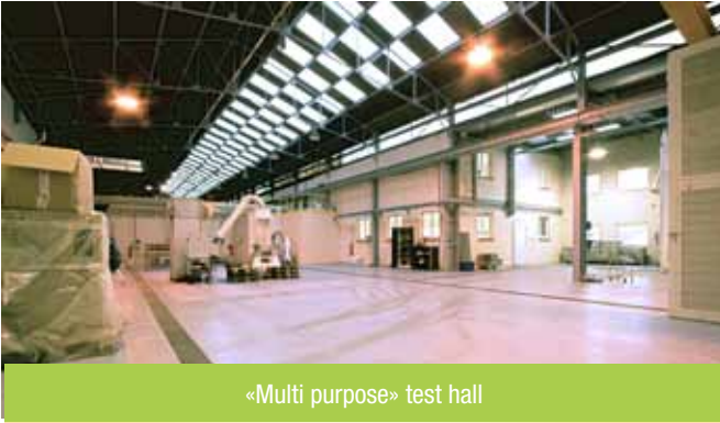
«Multi purpose» test hall