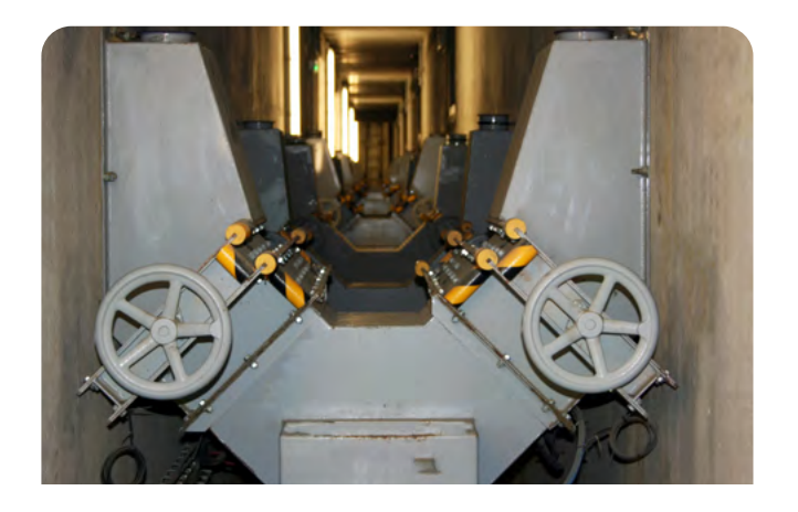
Valves under cells