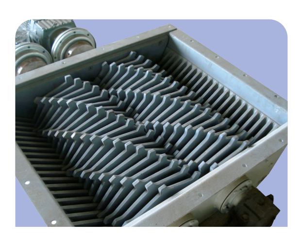
Double rotor lump breaker with toothed discs, optimized for cassava