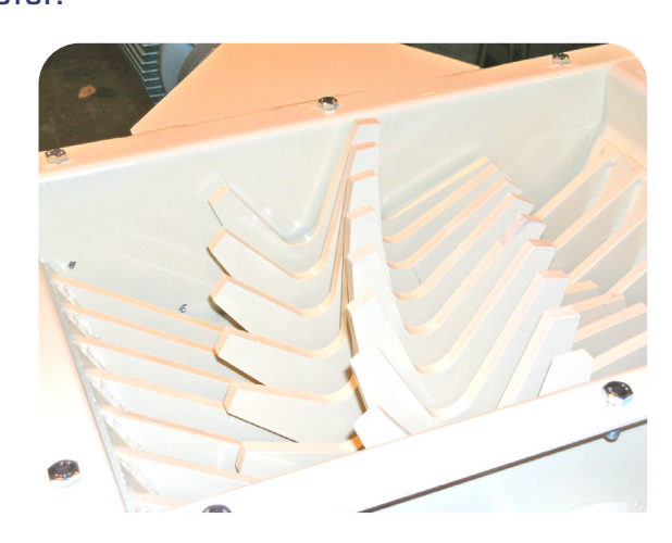
Single rotor lump breaker

Their lubrication is ensured by manual greasing devices, and direct drive by hollow shaft gear motor