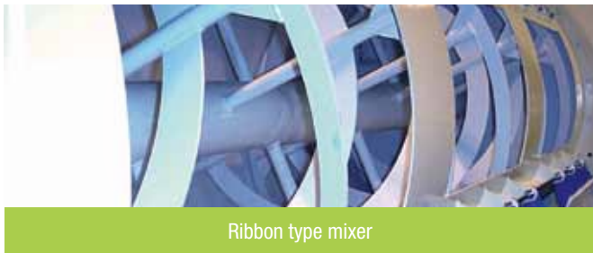
Ribbon type mixer